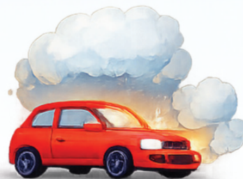
Diesel & Petrol Vehicles